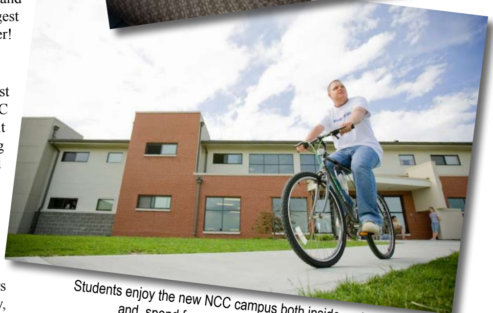
Students enjoy the new NCC campus both inside and out and spend free time in their dorm room.