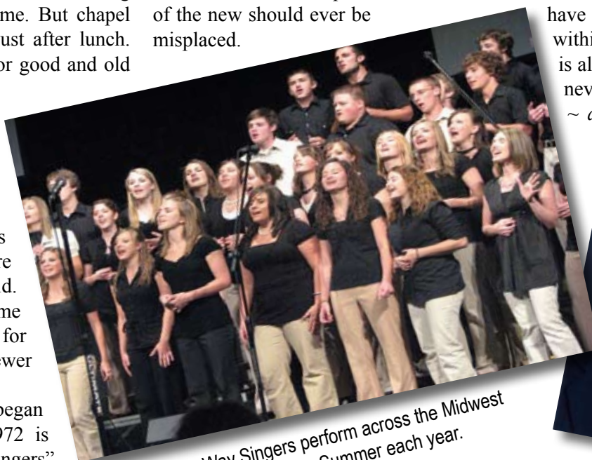
New Way Singers perform across the Midwest during the Summer each year.