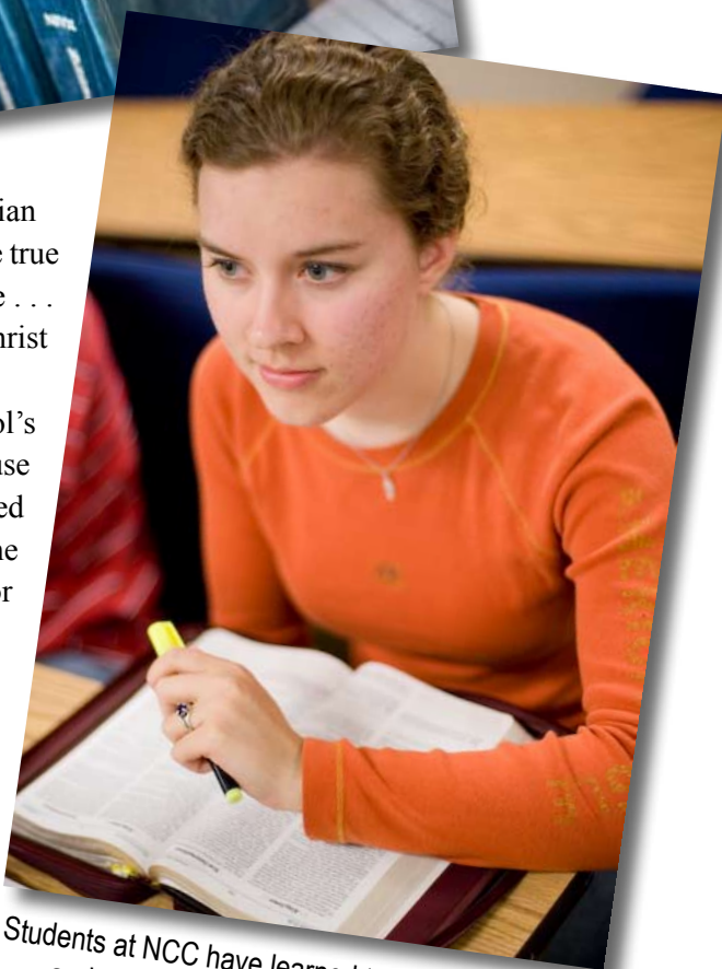
Students at NCC have learned to spread the word and work of God to the world since 1945.